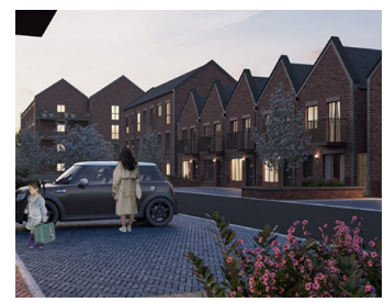
CGI produced by our in house visualisation team